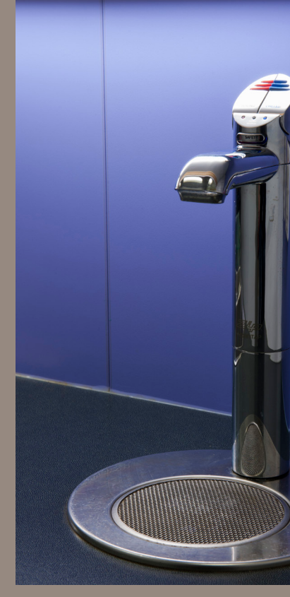
The backroom and staff areas at Marischal College benefit from the durability of Polyrey's Papago HPL.